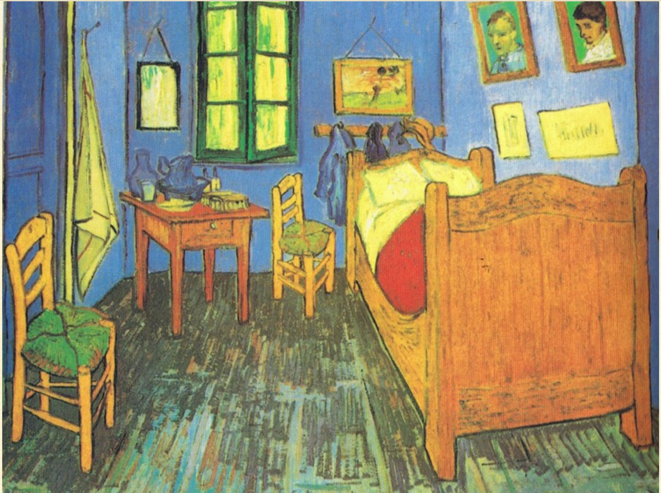
Van Gogh's room in Arles