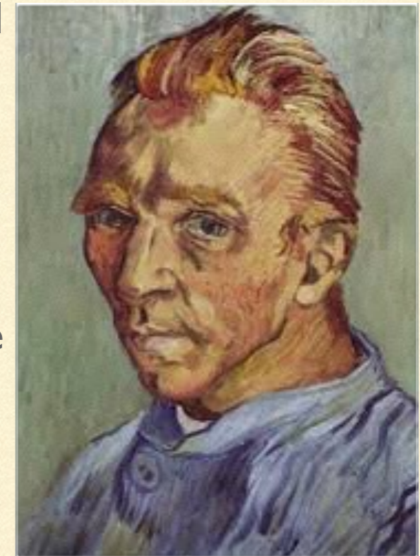
Self Portrait by Van Gogh 1889

the portrait was created near the suicide Van Gogh, which makes it crucial to understand the feelings in this piece. The texture of the post-impressionist piece is like others, however has its own twist where there are more expression lines towards the eyes to show his sadness. His mouth is in a false smile. The colors chosen in this piece were a blend of warm and cold colors to show his tries to become happy, but how his sadness would take over him shortly.