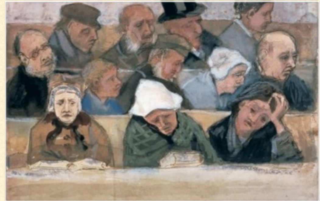
In the Church by Van Gogh 1882

The people in this piece have a completely different expression in contrast to the painting by Dalí. In his piece, the angels are in there perpetual happiness in guiding new people to new land.