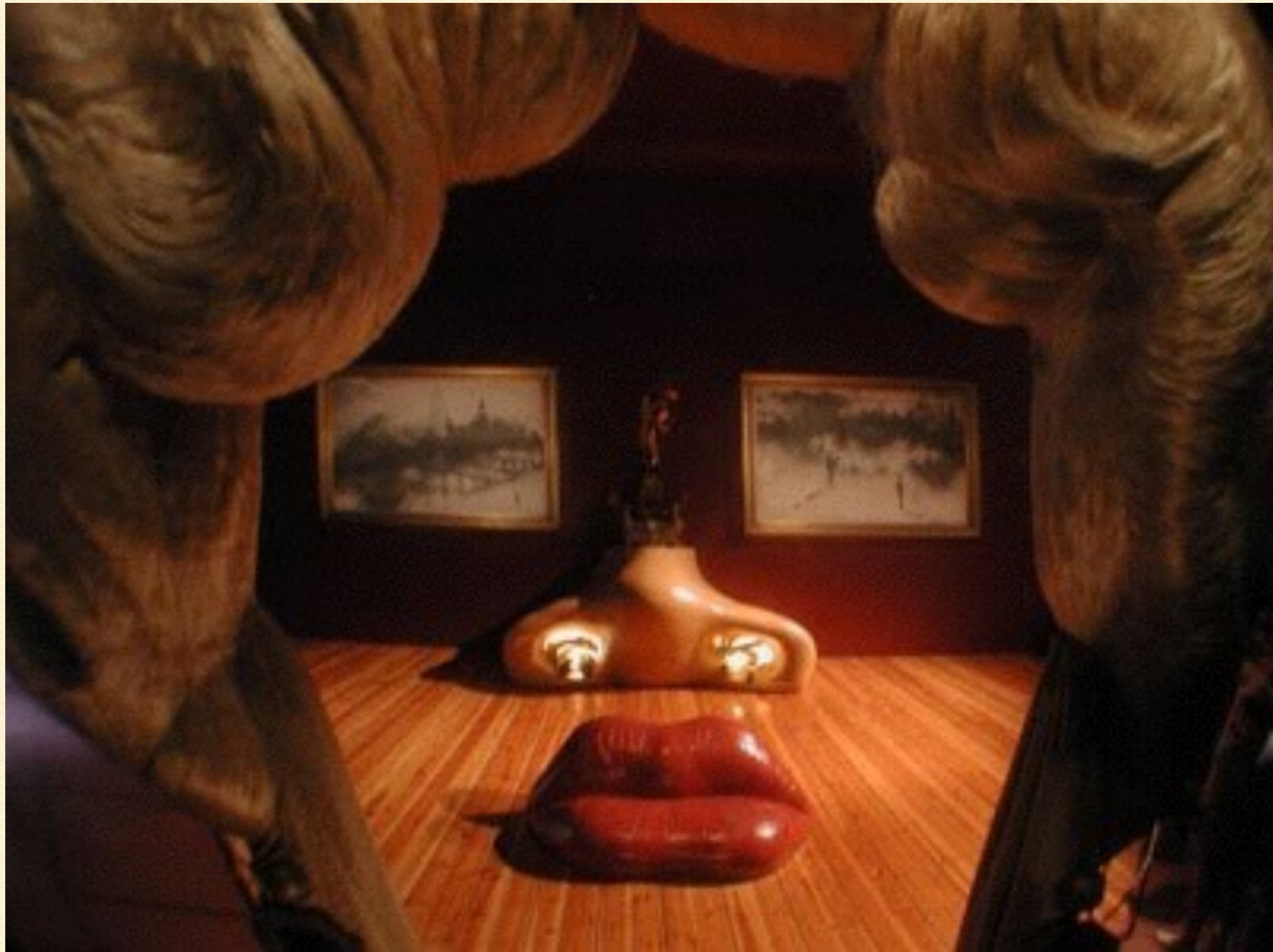
Dalí designed living room