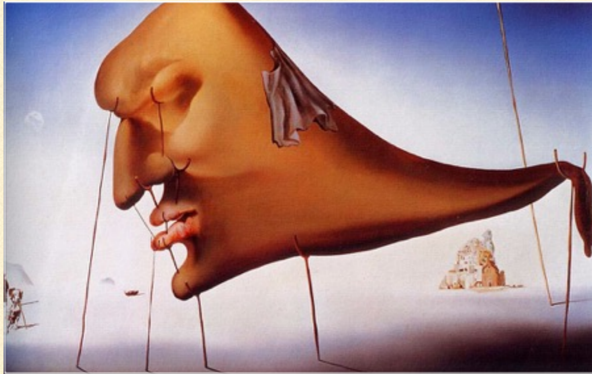
Sleep by Dali 1937