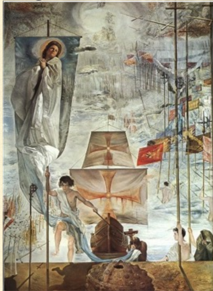
The Dream of Christopher Columbus by Dalí 1958-1959

Both of these pieces are similar in various ways. Dali and Van Gogh both had religious influences in some of their works.